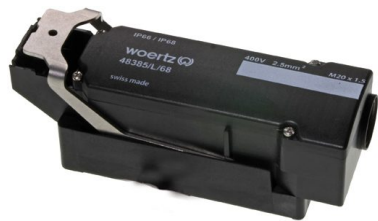
Junction box 5P(4mm 2 ) IP66/68 for Flat cable IP 5G6mm 2

48785/L/68 - Junction box FC power IP 5G6mm 2 IP68 5P