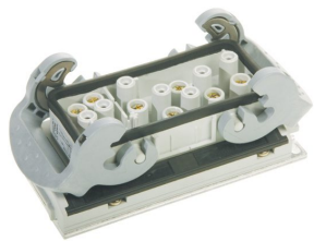
7x2.5mm 2 for connector No. 49626

49611 - Branching box FC 7G2.5 / 4mm² IP65 7P (49626)