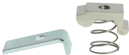
Slot nut M5 to DIN rail DIN32 without screw

3750/5OS - Slot nut M5 to DIN rail DIN32 without screw