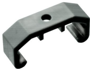
Cable clamp 13.5 mm to flat cable Technofil to screw on

9054 - Cable clamp 13.5 mm to flat cable Technofil