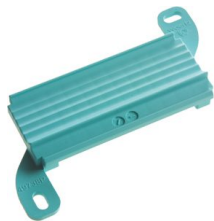
Slider to junction boxes

49738P - Slider with lugs to FK power 5G2.5 mm²