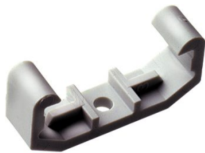
Flat cable clamp